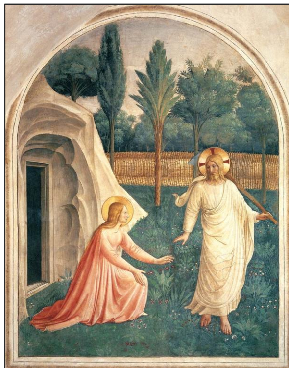
ANGELICO, Fra, Noli Me Tangere, 1440-42