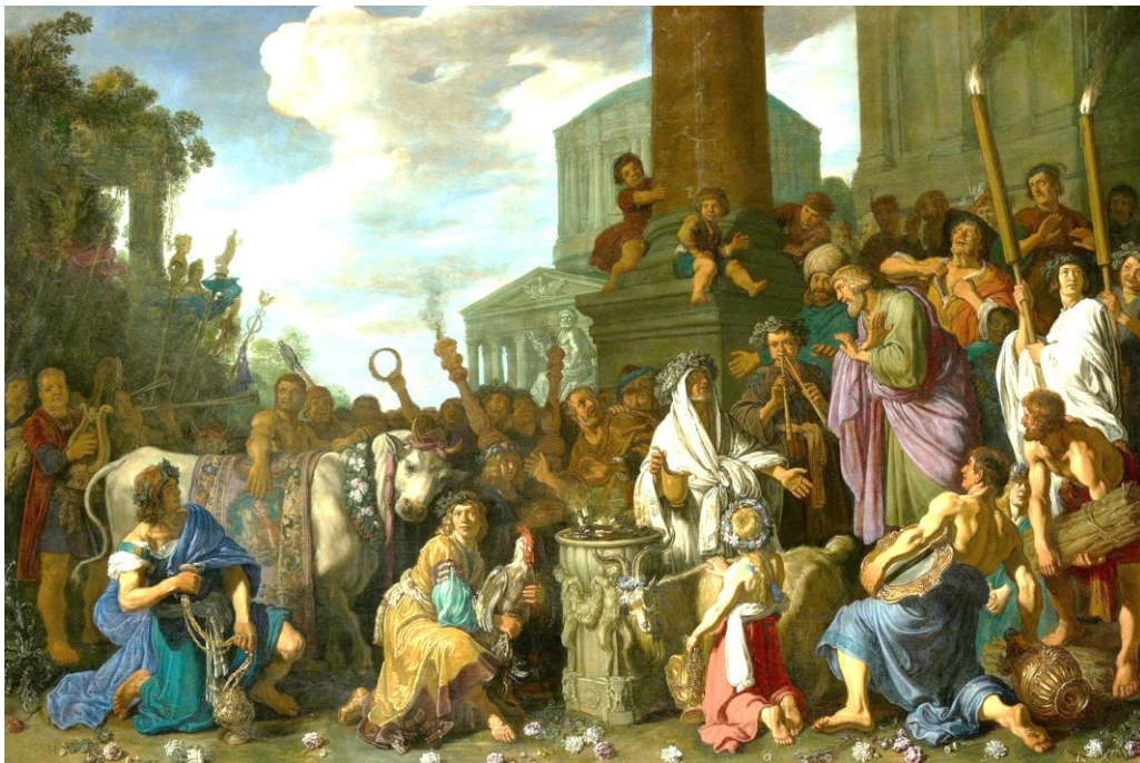
Pieter Lastman, Paul and Barnabas in Lystra 1617