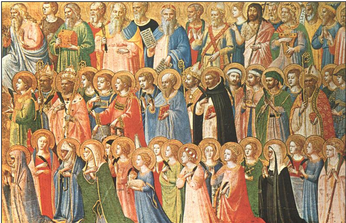
ANGELICO, Fra, Predella of the San Domenico Altarpiece Fiesole (detail)