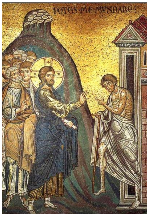
Christ Cleans the Leper (Byzantine Mosaic)