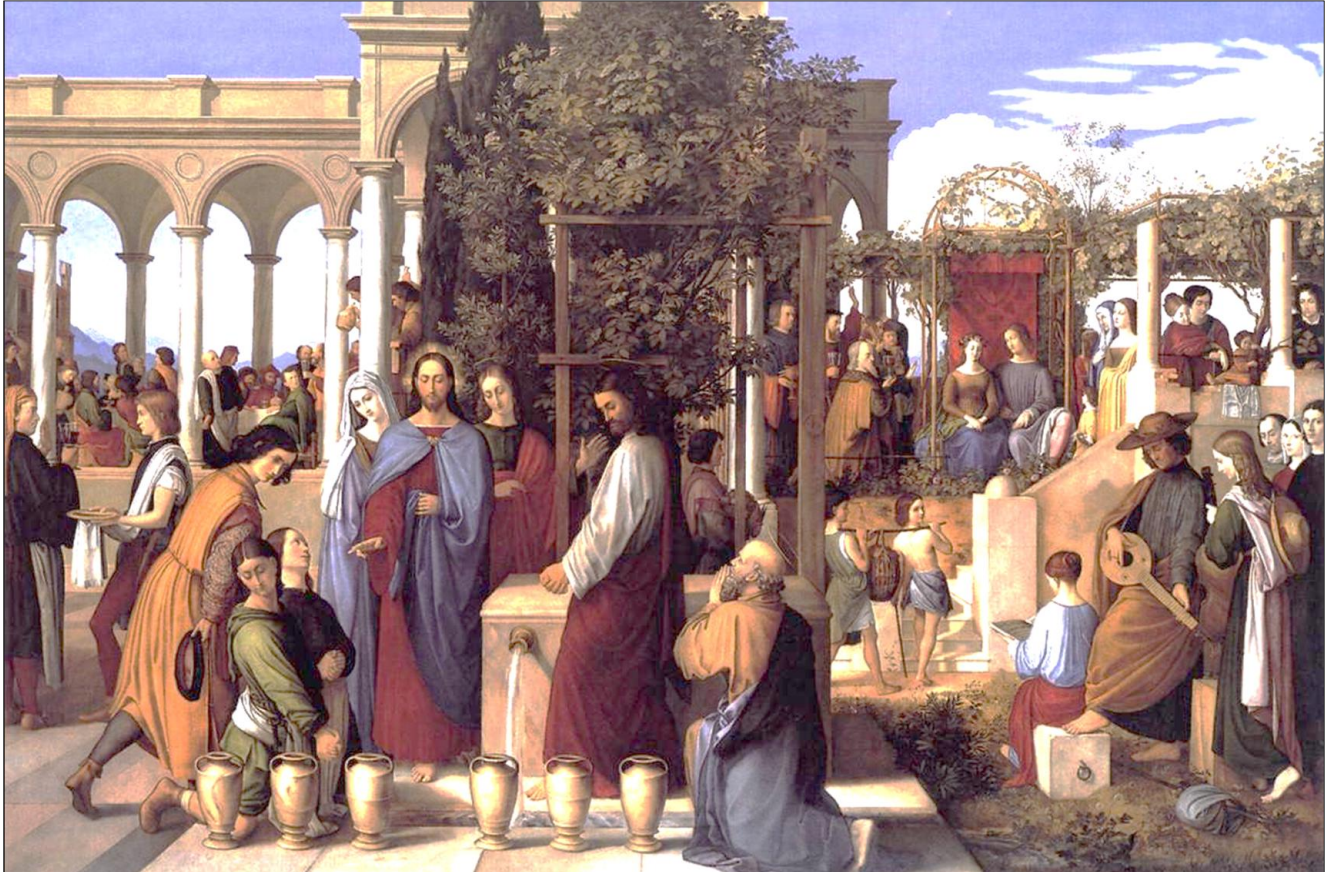
SCHNORR VON CAROLSFELD, Julius, The Wedding Feast at Cana, 1819