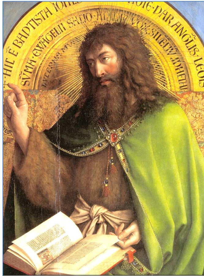
EYCK, Jan van, John the Baptist, The Ghent Altarpiece, 1425-29