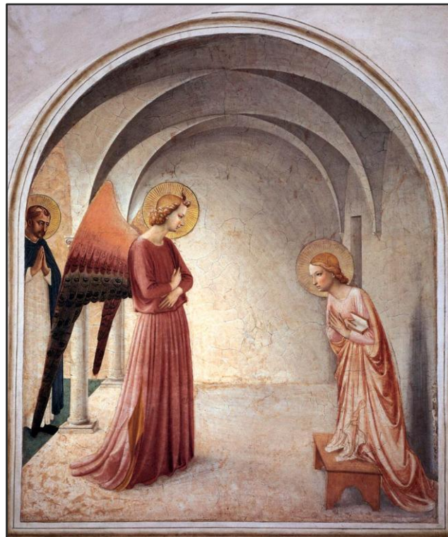
ANGELICO, Fra, The Annunciation, 1440-42