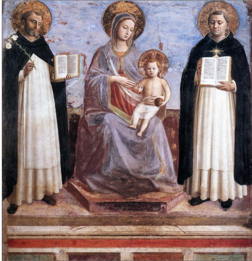
ANGELICO, Fra, Virgin & Child with St Dominic & St Thomas Aquinas, c. 1445