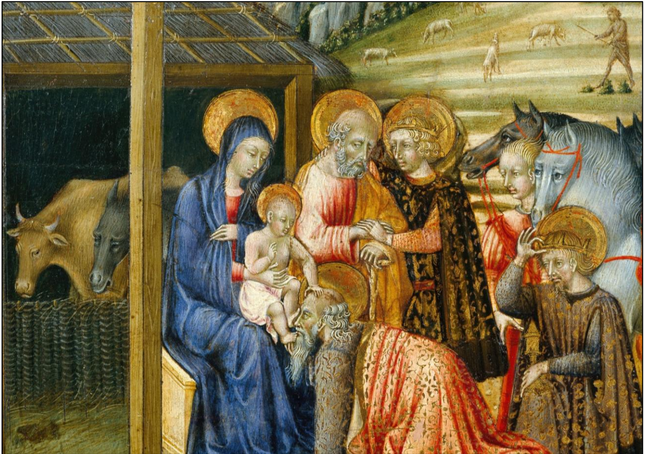
PAOLO, Giovanni di, The Adoration of the Magi, detail, 1460