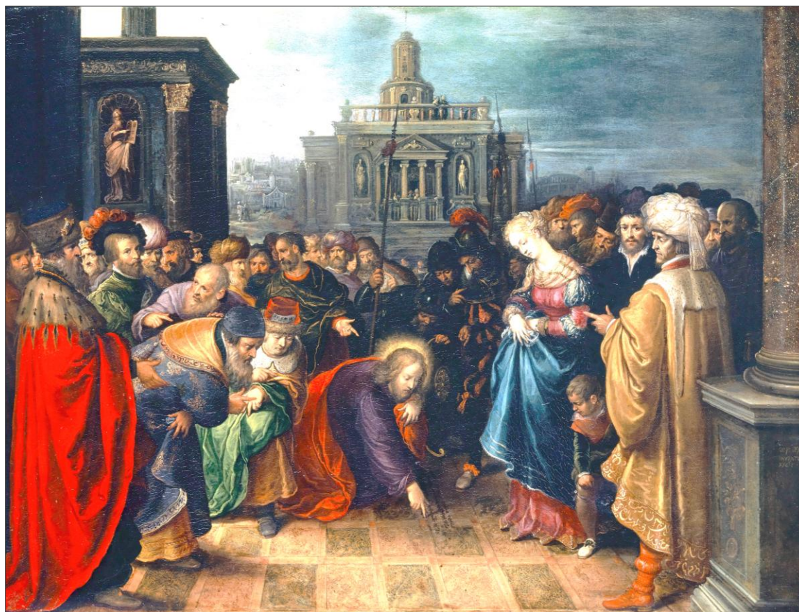
Christ And The Woman Taken In Adultery (1612), Frans Francken the Younger