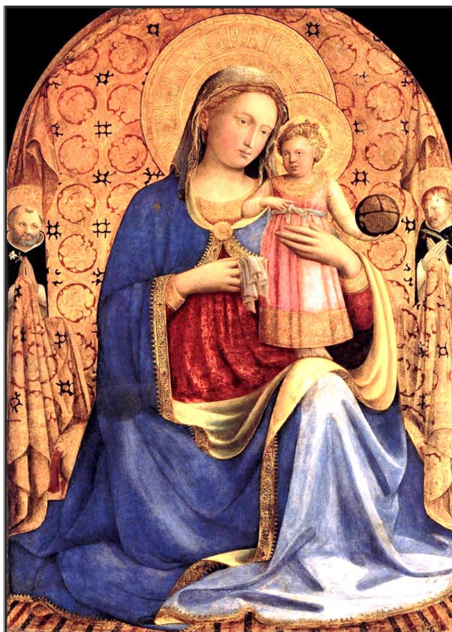
ANGELICO, Fra, Madonna & Child, 1433