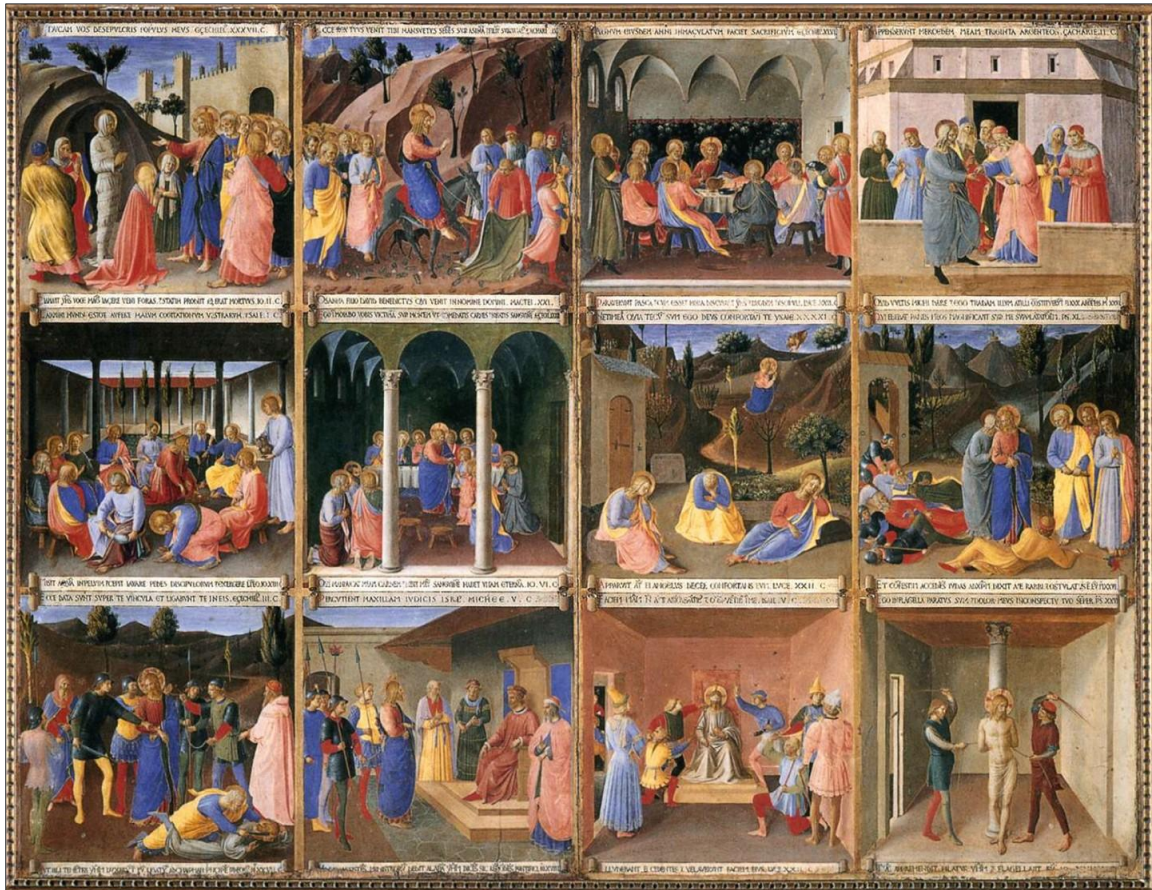
ANGELICO, Fra, Scenes from the Life of Christ, 1451-52