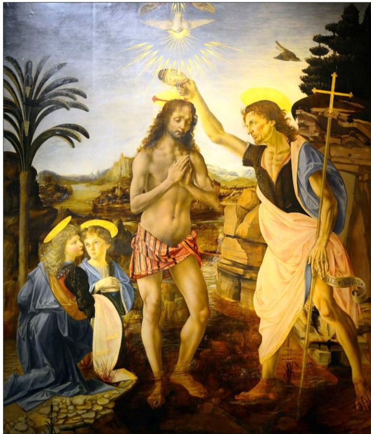
VERROCCHIO, Andrea de & DA VINCI, Leonardo, The Baptism of Christ, 1475