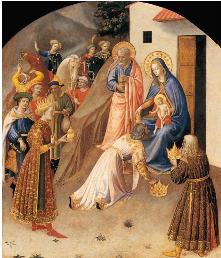
ANGELICO, Fra, Adoration of the Magi, 1423-24