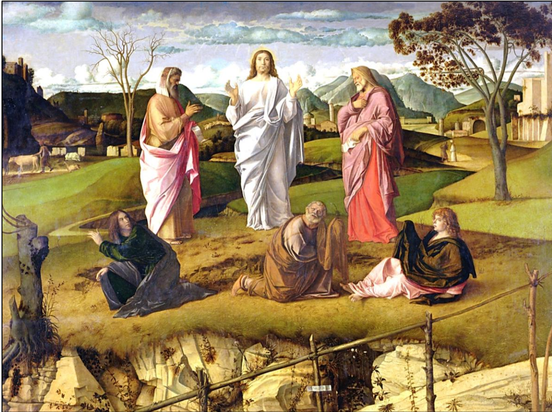
BELLINI, Giovanni, Transfiguration of Christ, 1480