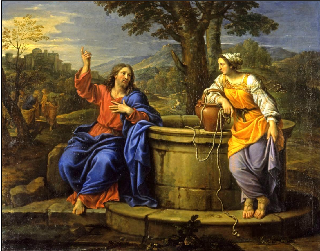
Christ and the Woman of Samaria (1681) Pierre Mignard (French, 1612-1695)