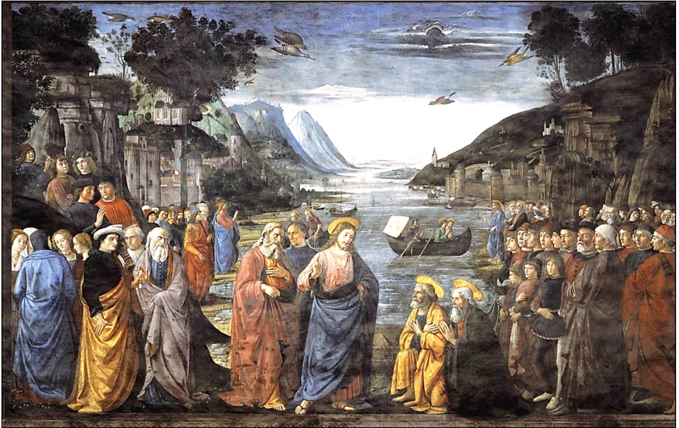
GHIRLANDAIO, Domenico, Calling of the Apostles, 1481, Cappella Sistina, Vatican