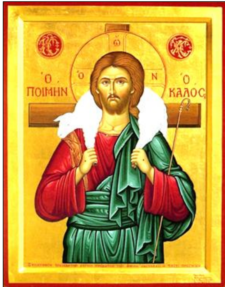
Christ the Good Shepherd