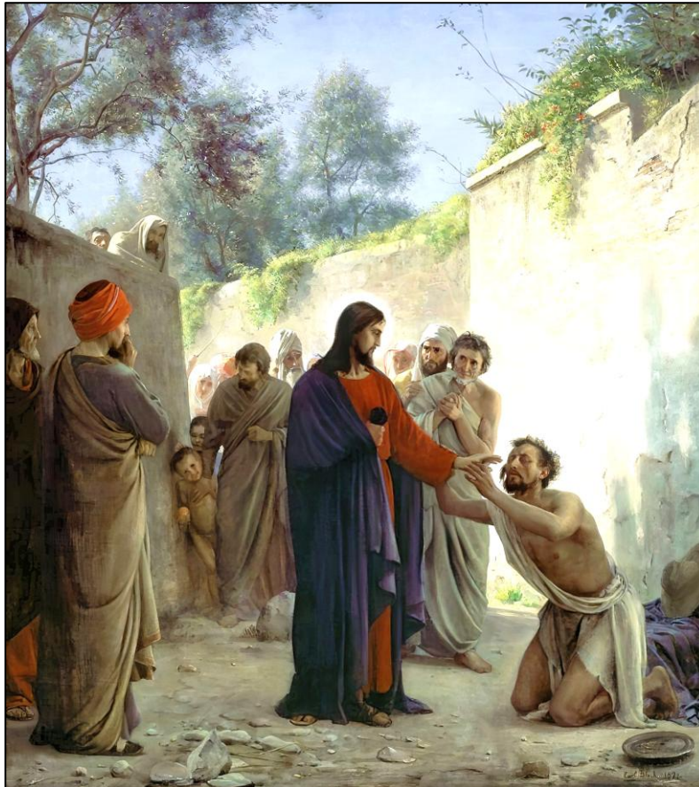
Christ Healing the Blind Man Carl Bloch (Danish, 1834-1890)