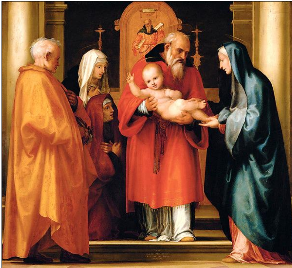
BARTOLOMEO, Fra, Presentation of Jesus in the Temple, 1516