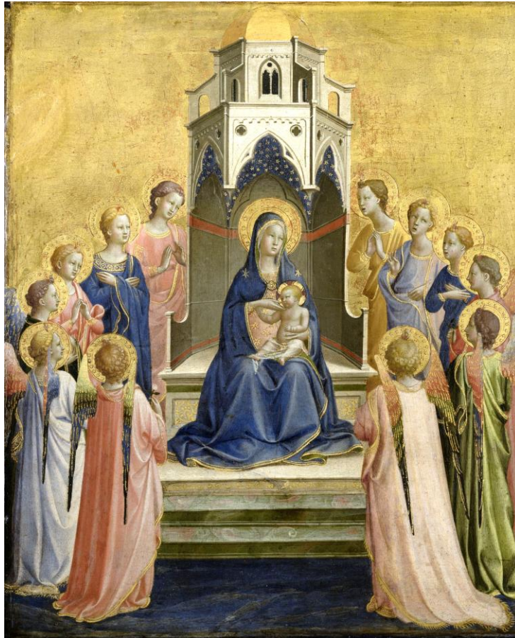
Madonna and Child Enthroned and Twelve Angels (1420 - 1430) Fra Angelico (Italian, 1400-1455)