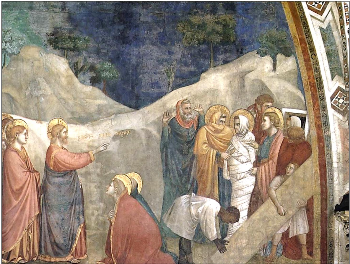
BBONDONE, Giotto Di, Raising of Lazarus, 1304-06