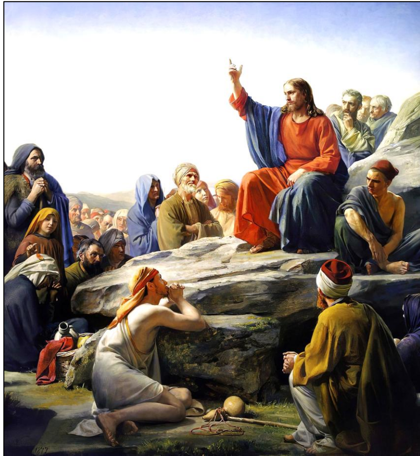
The Sermon on the Mount, Carl Bloch (Danish, 1834-1890)