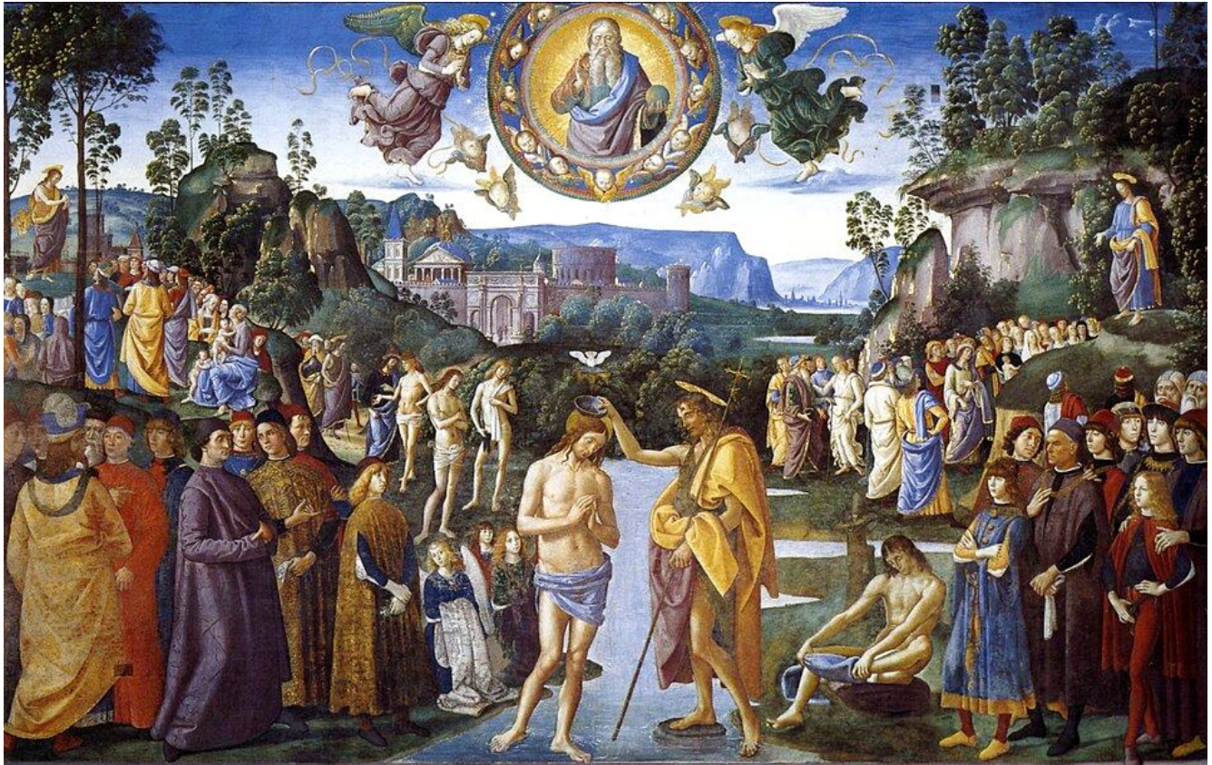
The Baptism of Christ, Pietro Perugino (1448–1523), Sistine Chapel