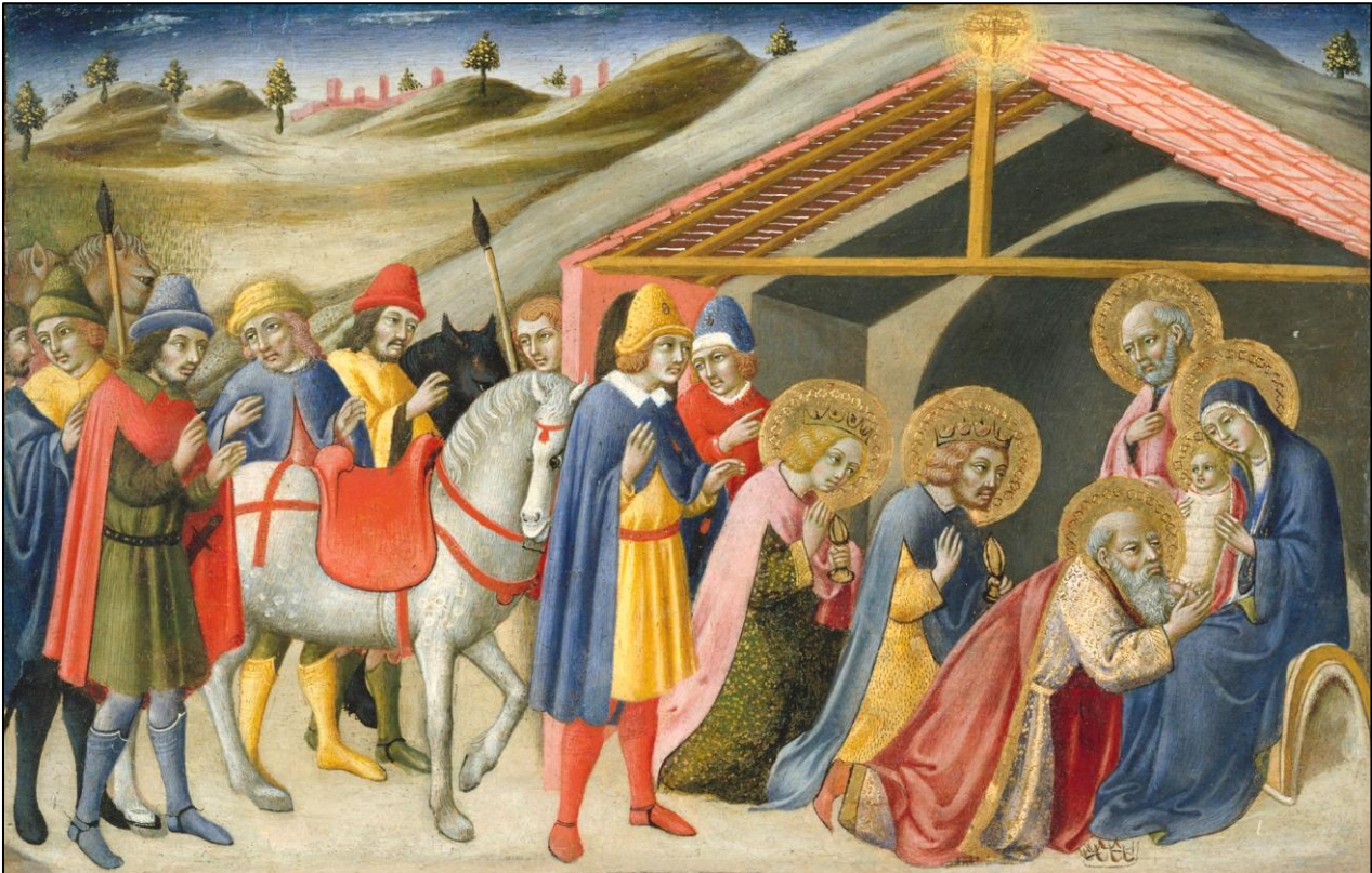
The Adoration of the Magi (ca. 1470) Sano di Pietro (1406-1481)