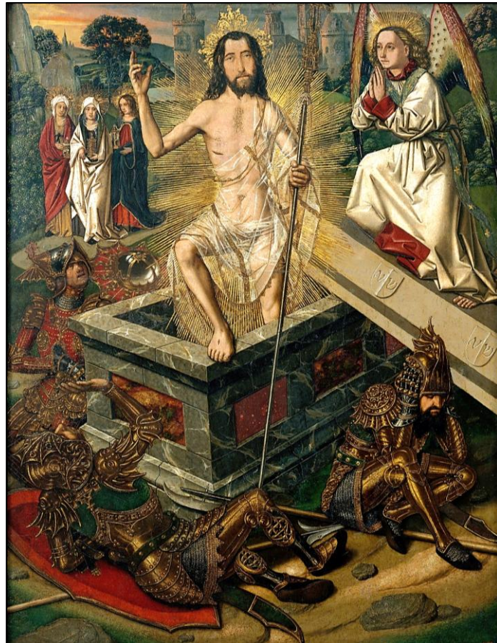
BERMEJO, Bartolome, Resurrection (circa 1475)