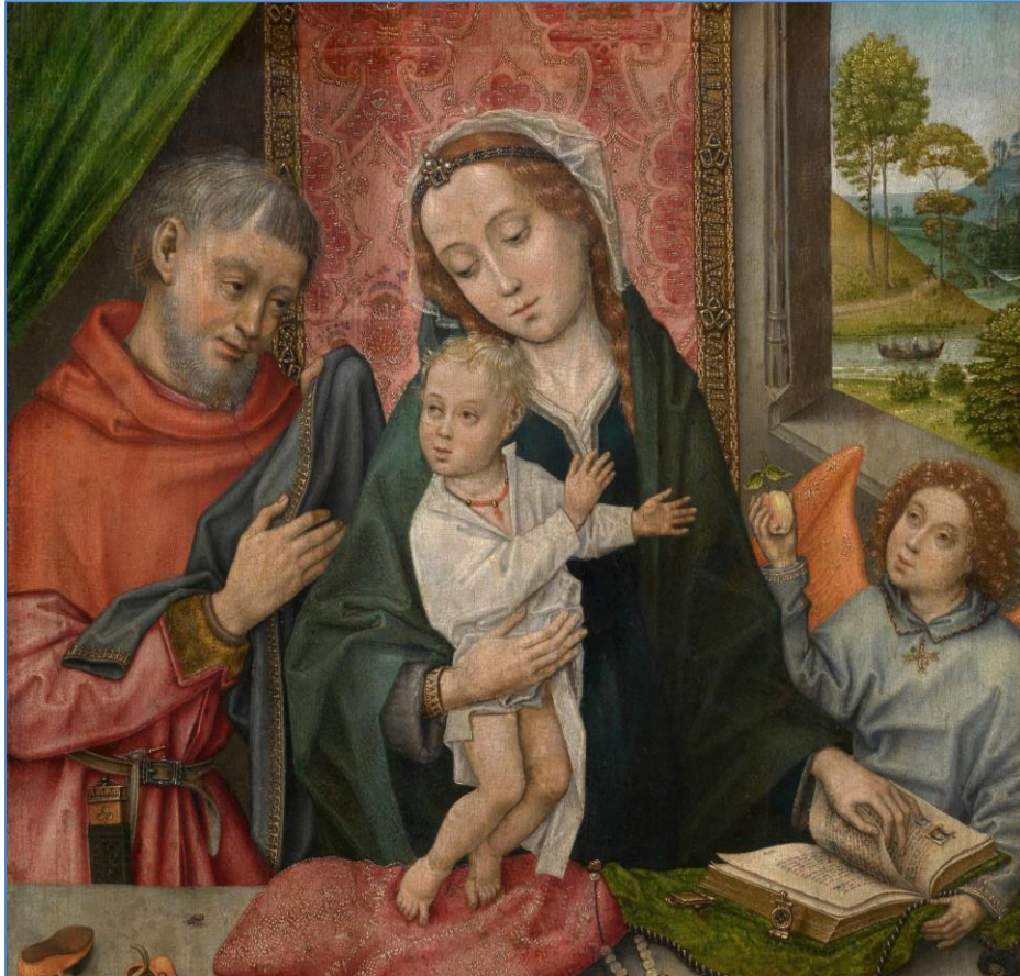
The Holy Family with an Angel, 1500s, Author Unknown