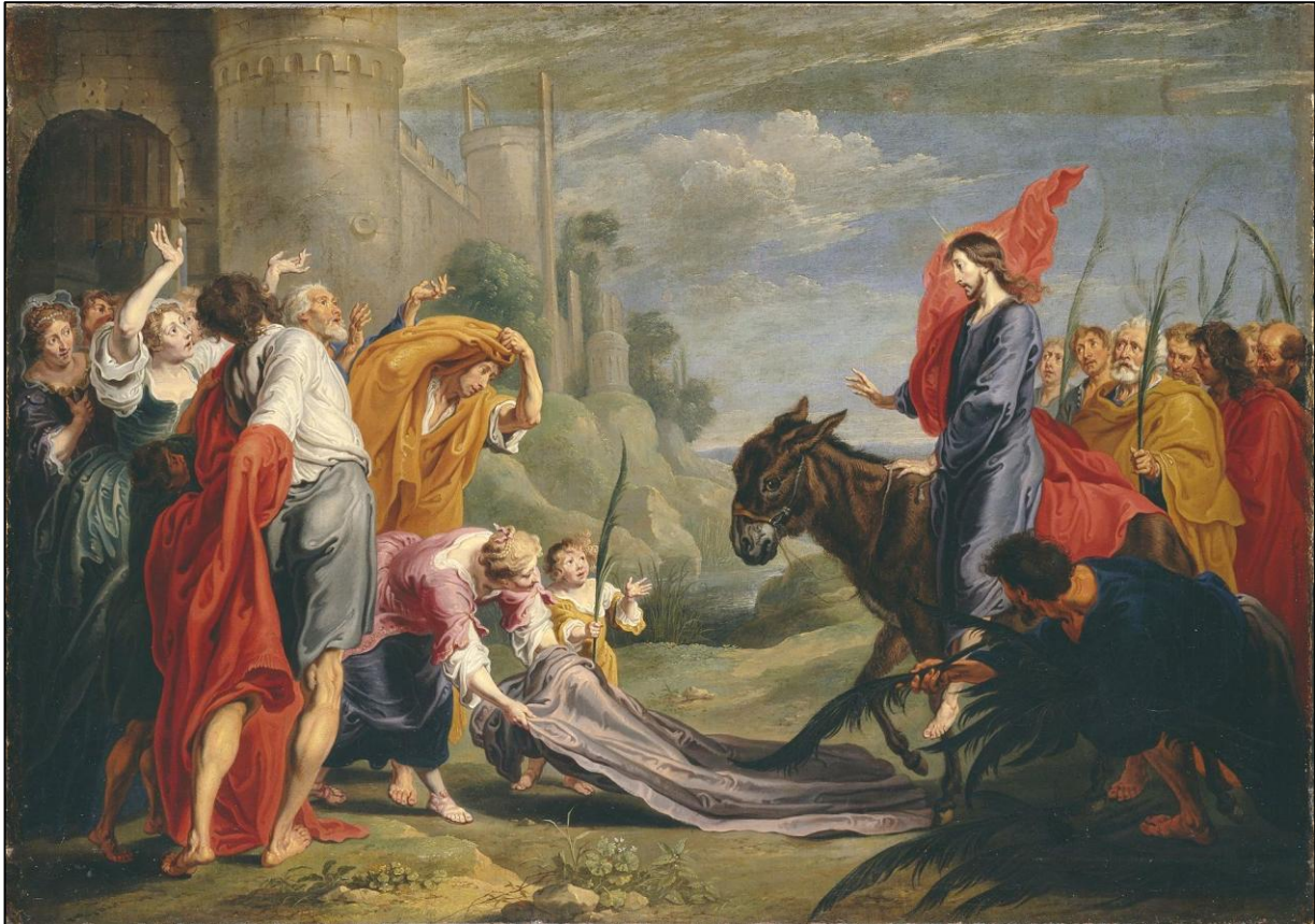
The Entry into Jerusalem Willem van Herp (Flemish, 1614–1677)